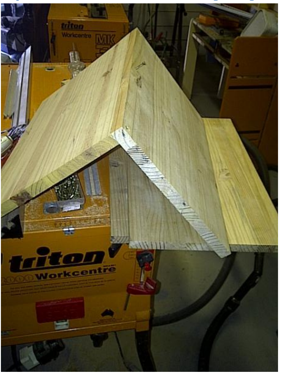
Step 1: Assemble the 1st two sides at a 90 degree angle using 3 screws